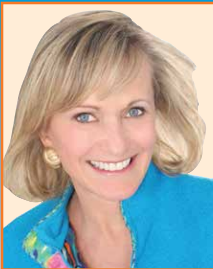
Kay KOPLOVITZ Founder of USA Network