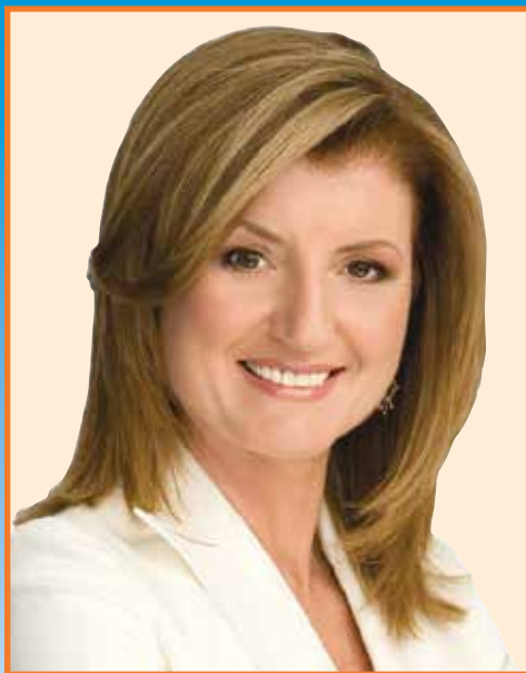
Arianna HUFFINGTON President and Editor-in-Chief of Huffington Post Media Group